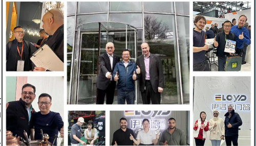
Photo with customers

During the epidemic, it is very difficult to book shipping containers for export (not simply the increasing fees, many exporters cannot book containers on time) which will not only directly affect the normal schedule of your project, but also will cause you a greater increase in costs that were not expected. We are the only "Alibaba Elite" merchant in the window and door industry on this platform, we have priority booking rights and get the best price for the shipping, so we can guarantee that your goods will arrive as scheduled and will save you a lot of money.