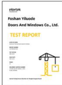
intertek Total Quality Assured.